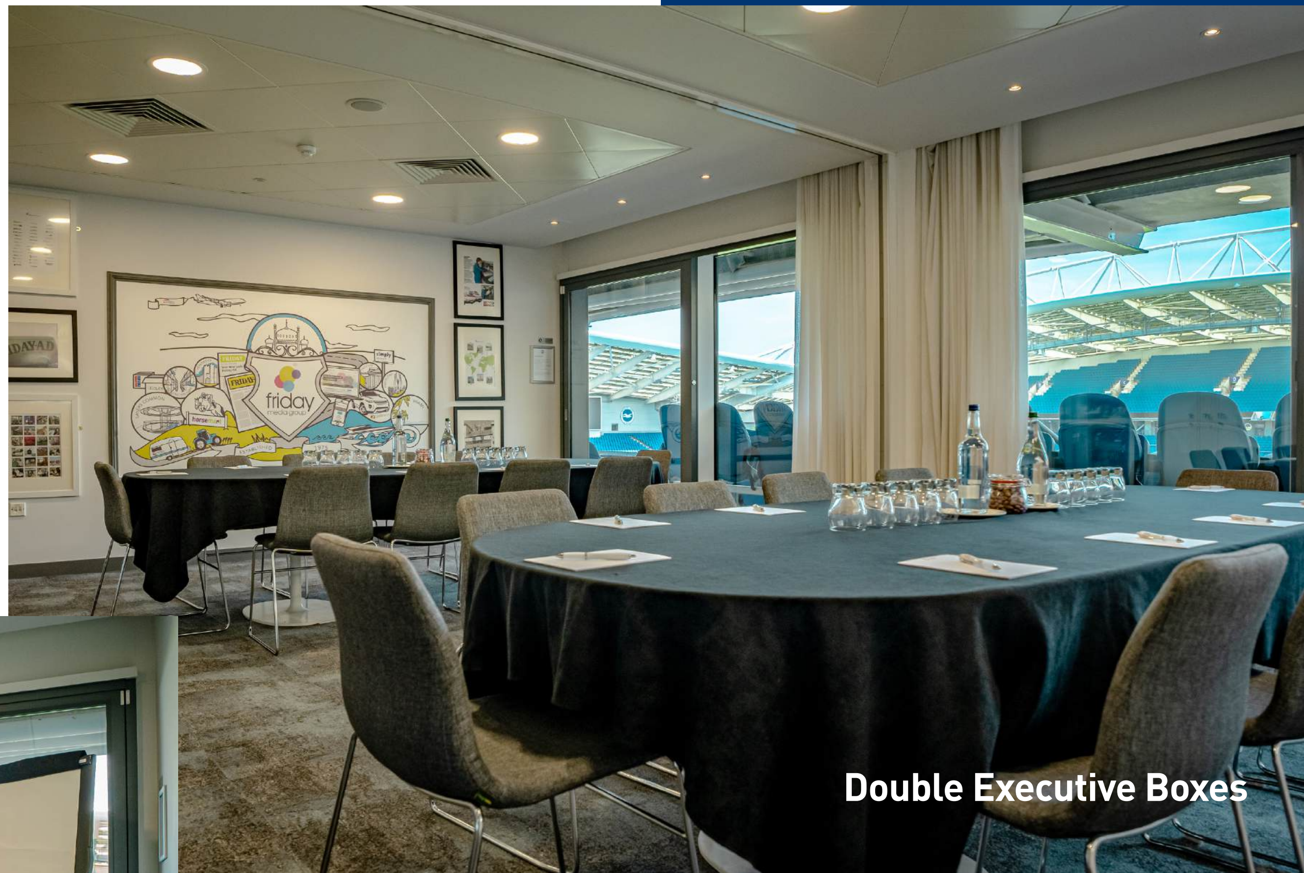
Double Executive Boxes

Play host to board meetings or a private dinner for groups of up to 20 people. Also creates the perfect breakout space, conference organiser's office or speaker's green room whilst and providing the opportunity to take in a stunning pitch side view.