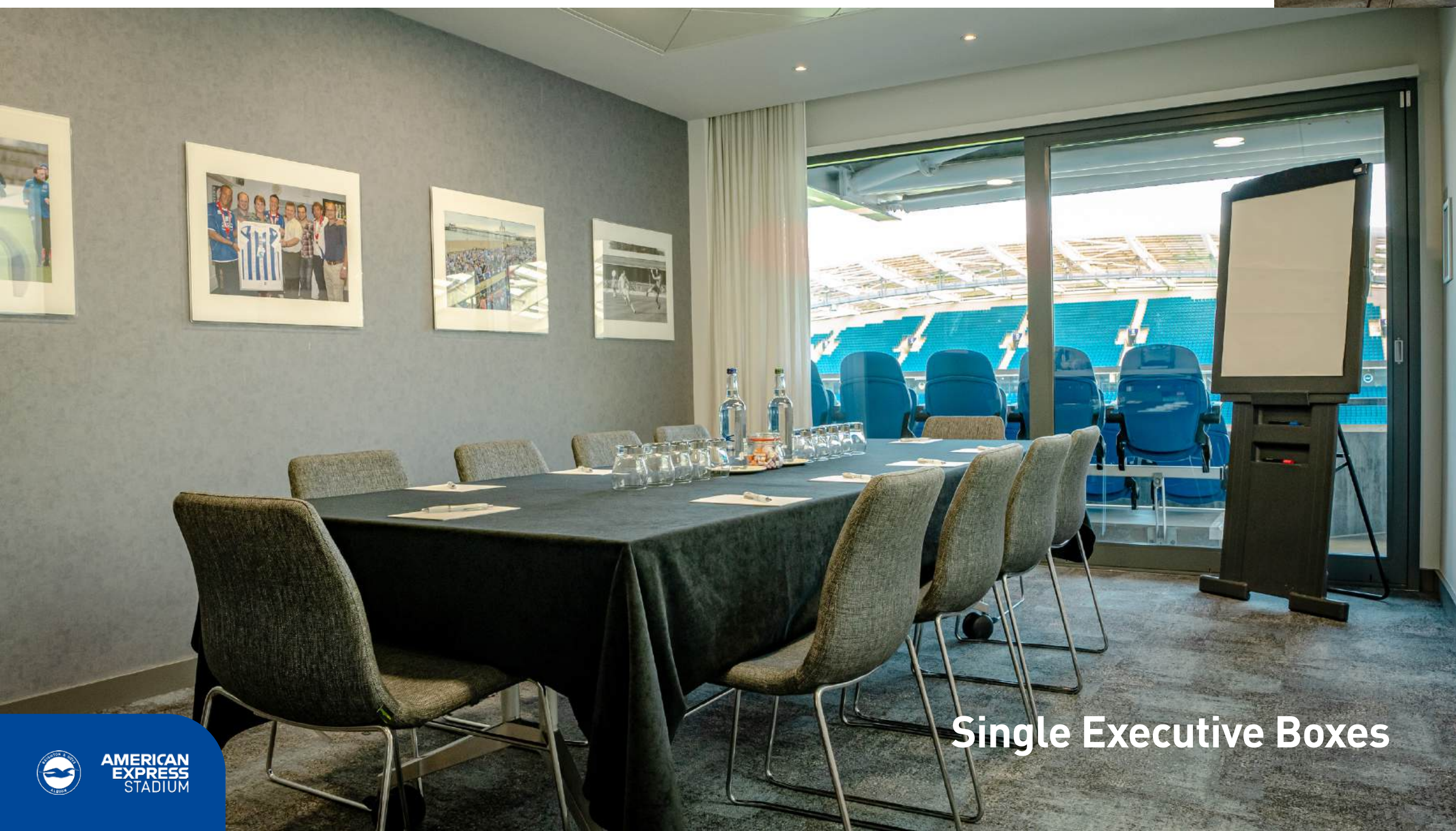
Single Executive Boxes